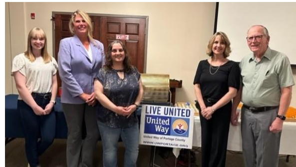
Five winners shared the $2,000 Reverse Raffle grand prize to cap off a great night!