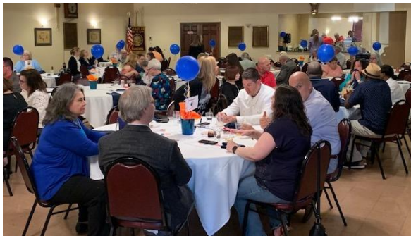
UWPC supporters gathered for the Reverse Raffle on April 13 at the Ravenna Elks Club.

Thank you to the United Way Staff, Board Members and Campaign Committee Members who helped set up, sell raffle tickets, and attend the event.